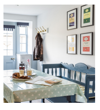
The Carriage House, Middleham, is available to rent through Beautiful Escapes. beautifulescapes.